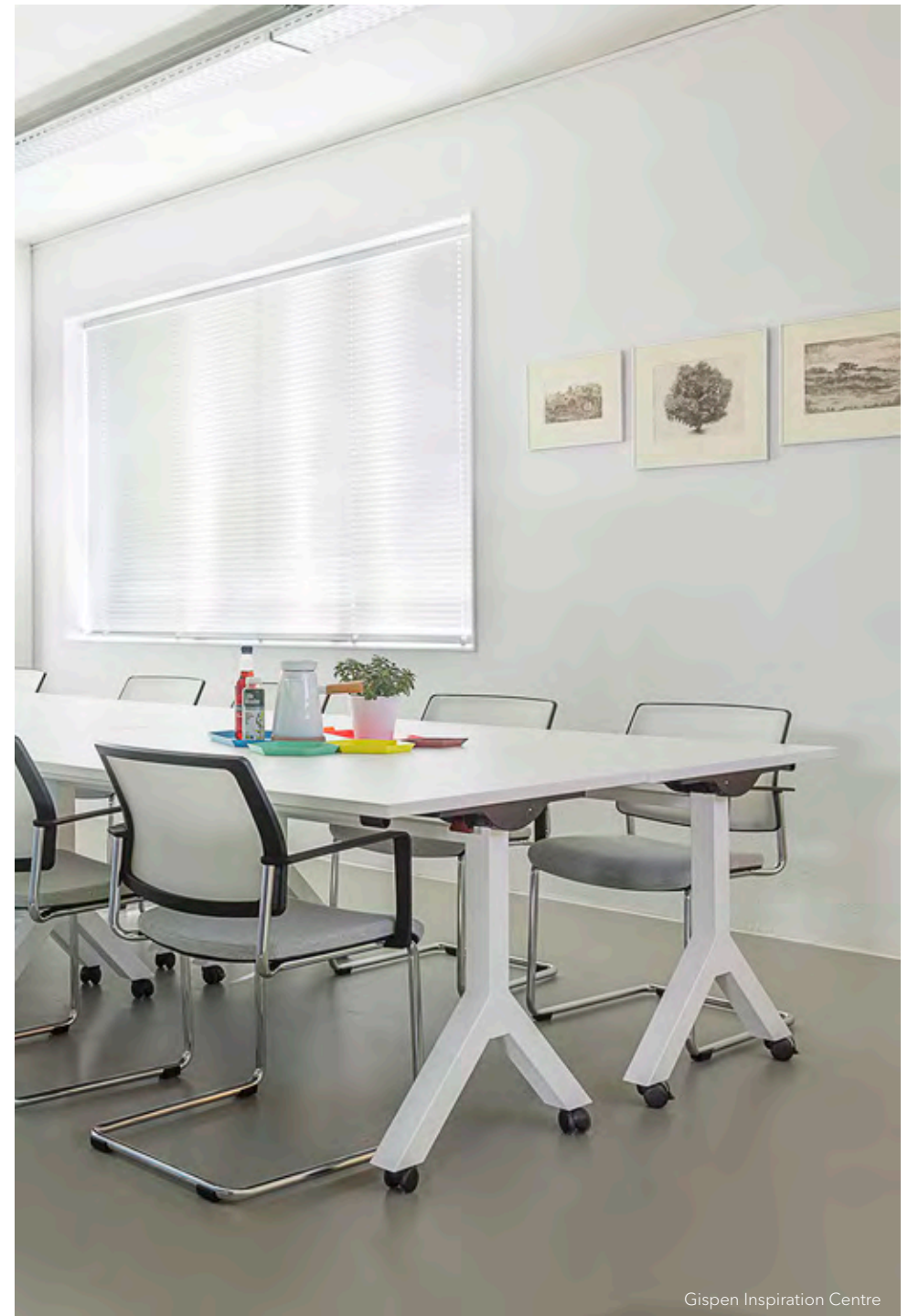
Gispen Inspiration Centre