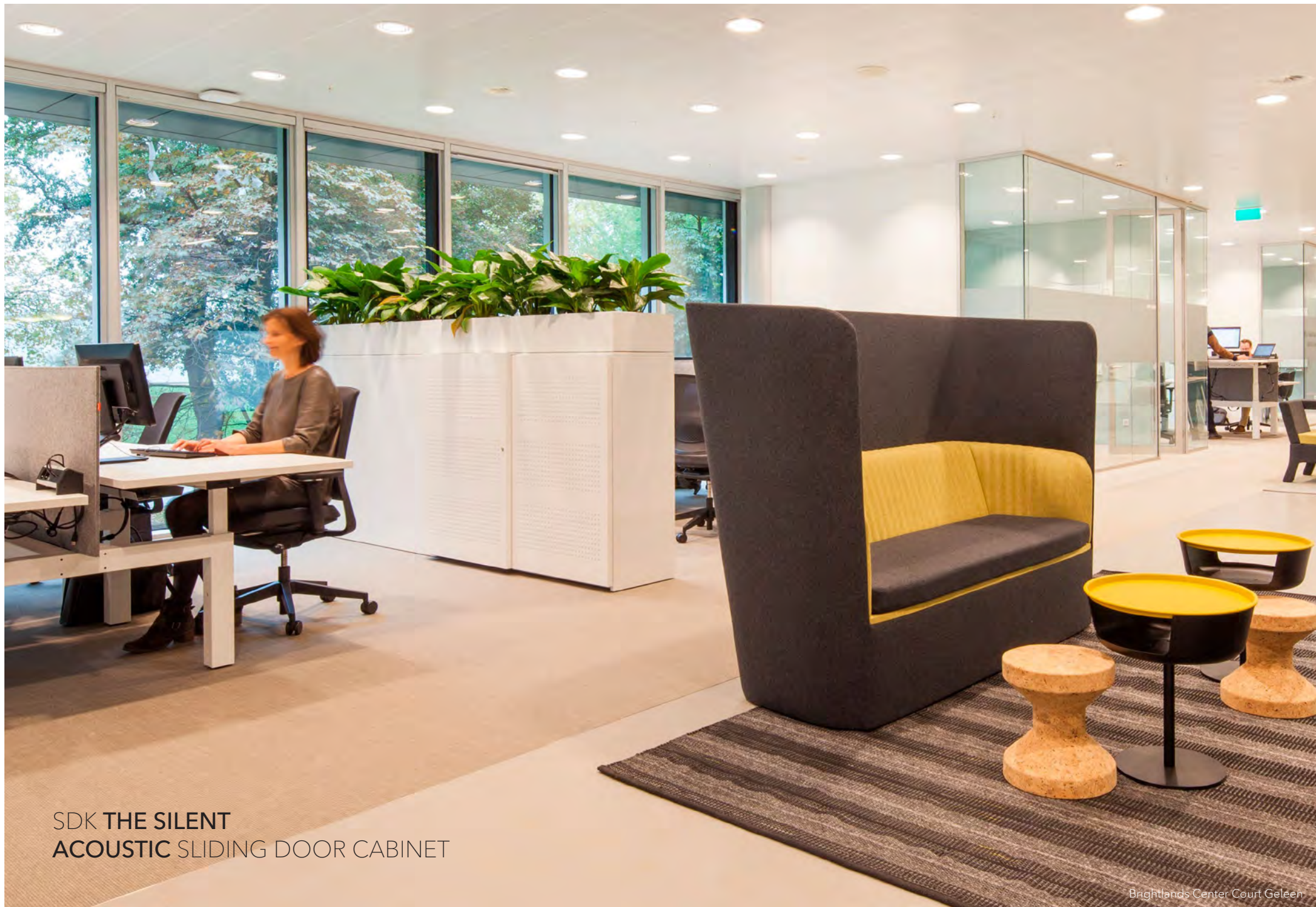
SDK THE SILENT ACOUSTIC SLIDING DOOR CABINET