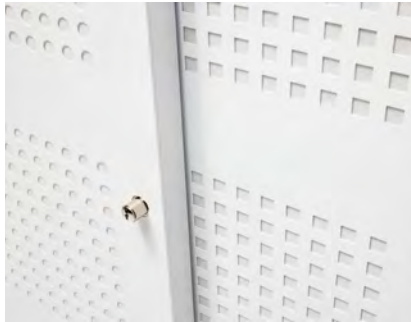
Round or square perforation